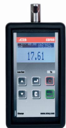
CDF 60 Leak/Flow Calibrator